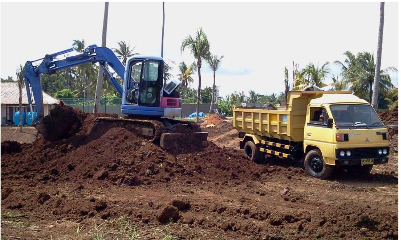
Kaba Kaba Estate

Our team consists of site architects, administration specializing in the field of landscape construction and a budget analyst. We oversee the project, time frames and scheduling and the work of landscape construction and design where more than one landscape contractor may be used to carry out a larger scale project. Our team is proficient in working with landscape software and understand local regulations regarding plantings and landscape design.