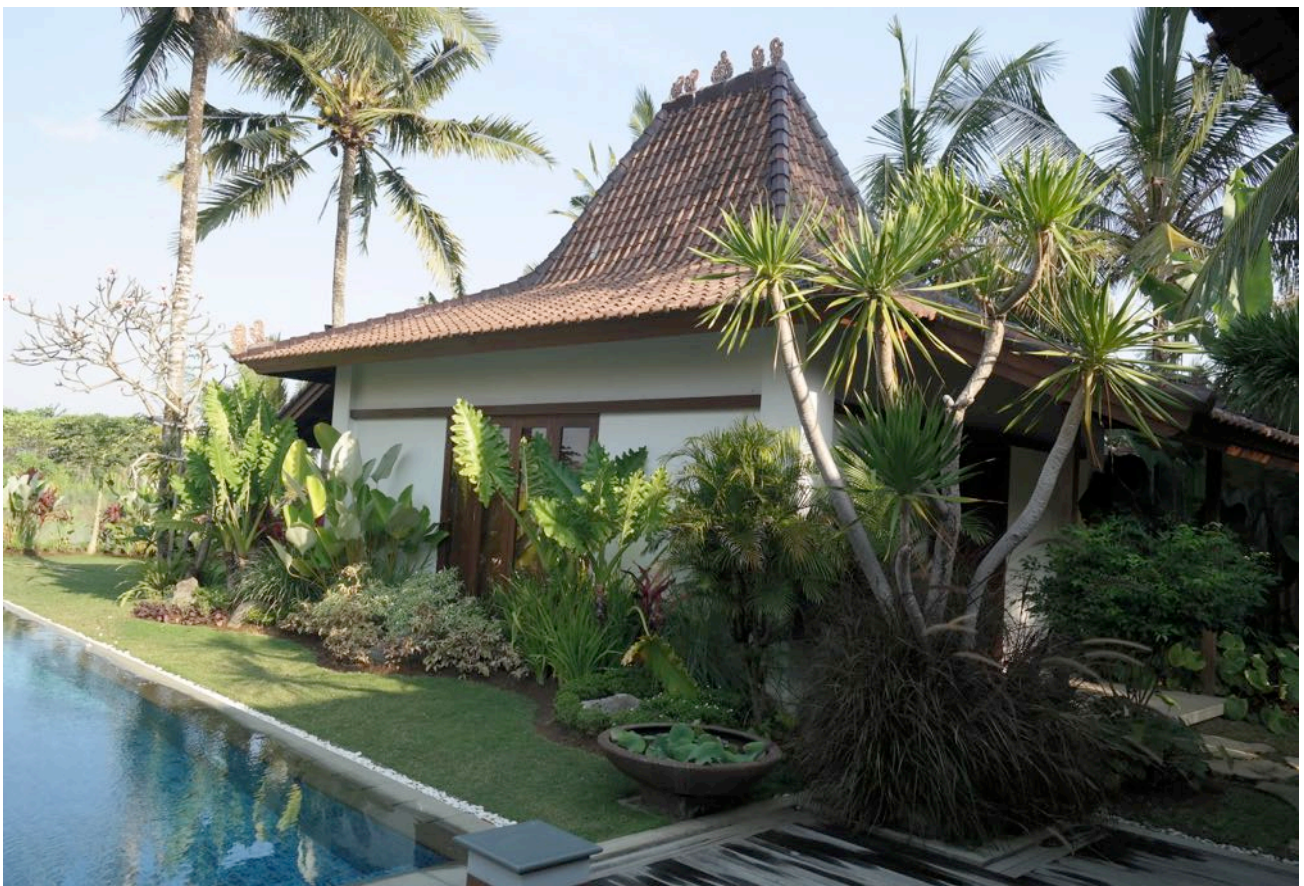
Villa Pujian at Lodtunduh

We are supported by IPB Bogor Agriculture Institute and the Agriculture Faculty of Unud University, Bali for soil assessment, pH tests and information as to tolerance of plants and trees across may diverse soil and climate conditions through out most of South East Asia.