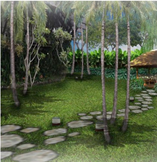
Royal Casa Grande, Ubud